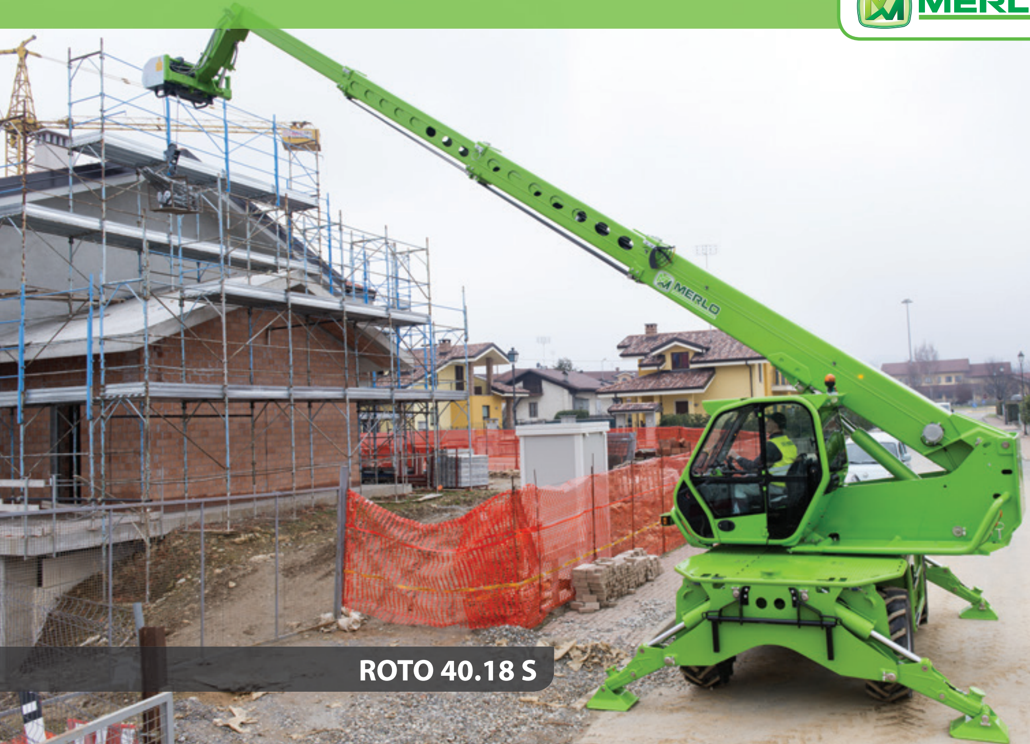
ROTO 40.18 S